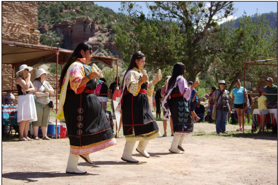
Audience watches Corn dance performance at Jemez Historic Site.

In September 2013, the Curator of Archaeological Research Collections provided a collections tour for members of the Pueblo of Pojoaque tribal government, focusing on archaeological materials that were collected from Pojoaque ancestral sites. The Pueblo's interest in these collections was related to their project to write a history of the people of Pojoaque. (The museum's NAGPRA