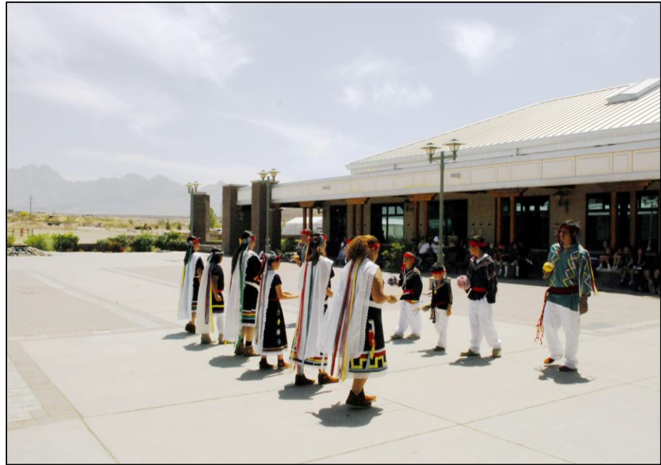
Los Indigenes de Nuestra Señora de Guadalupe , Tortugas Pueblo, perform traditional Native American blessings at the annual, ceremonial Fiesta de San Isidro at the New Mexico Farm & Ranch Museum.

The New Mexico Farm & Ranch Heritage Museum collaborates with the Los Indigenes de Nuestra Señora de Guadalupe , Tortugas Pueblo, to present and interpret traditional Native American blessings at the ceremonial beginning of the museum's Fiesta de San Isidro annual event. The museum also collaborates with Native American students at New Mexico State University who are members of the American Indian Science and Engineering Society. These students participate in the planning for "Ghosts of the Past," an annual event that features living history. The students also serve as support crew during the event or as historical characters, presenting in first-person performances.