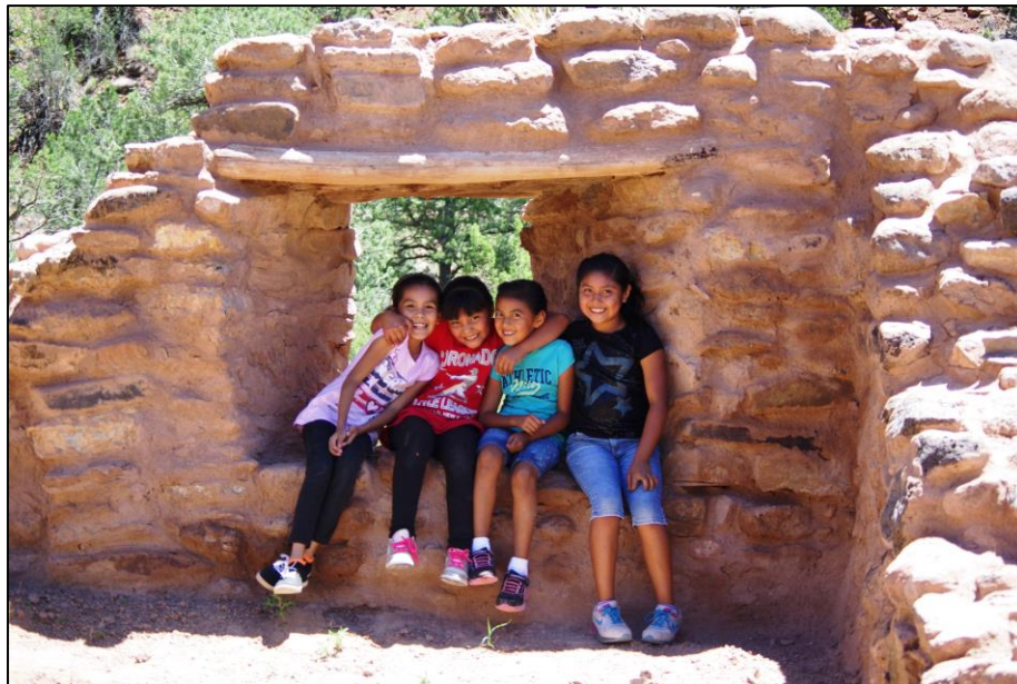
Students enjoy an educational trip to Jemez Historic Site.