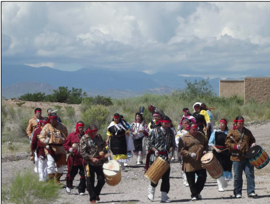
¡Fiesta Piro! at El Camino Real Historic Site featured Piro-Manso-Tewa of El Paso, Tortugas, and Las Cruces.

A new temporary exhibit within the Jemez Historic Site Visitor Center was put in place through the purchase of art from local tribal members. The purpose of this exhibit is to highlight present day culture of Jemez Pueblo.