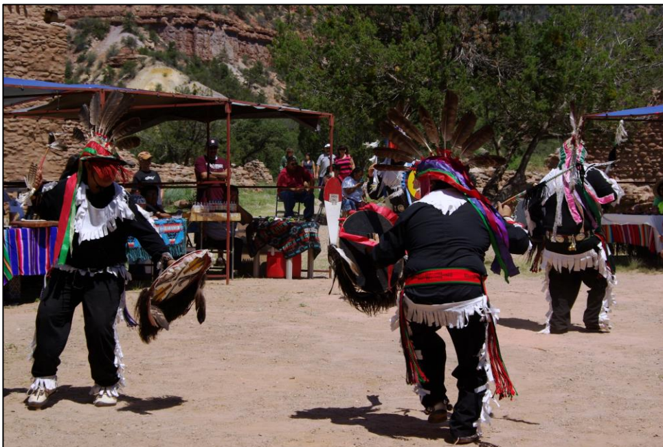
Shield dance performance at Jemez Historic Site.

Museum outreach to Indian Hills Elementary on May 14 th , 2014 had about 100 attendees (half adults, half children) with approximately 85% Native American attendees.