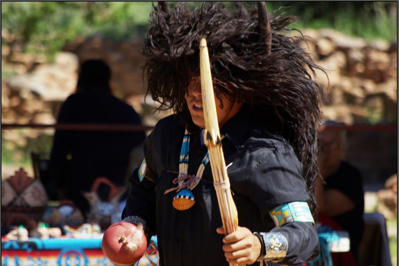
Buffalo dance at Jemez Historic Site.

STATE TRIBAL COLLABORATION ACT FISCAL YEAR 2014